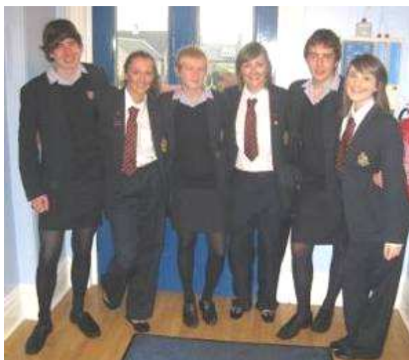
School uniform swap