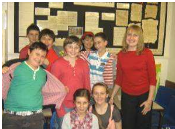
8NA wearing items of red

On non uniform day in October, pupils wore an item of red clothing or accessories to raise money for the Red Cross.