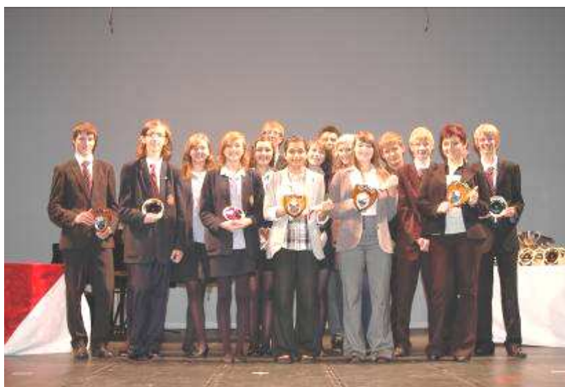
Some of our deserving winners

We were proud to award many of our talented pupils with prizes and certificates on the 15 th October, at the school's annual Speech Day.