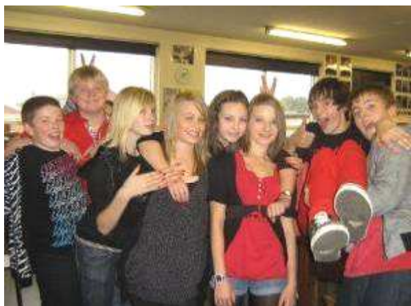
9AH wearing red clothing and nail varnish!