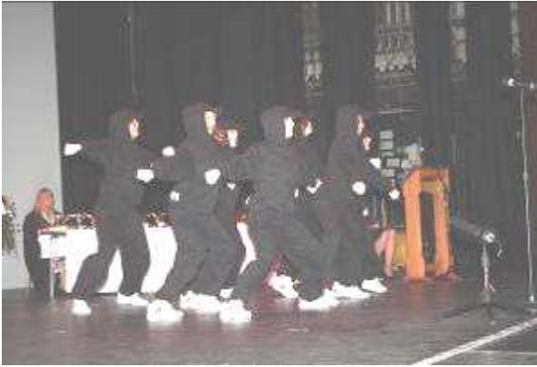
The Street Cheer group – Hip Hot Shots