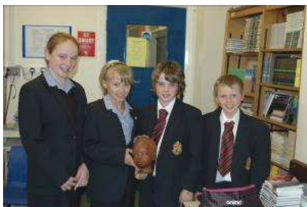
Some of 7HF with the Clay Head