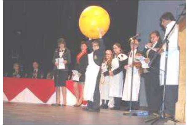
The science club present Thinking Differently