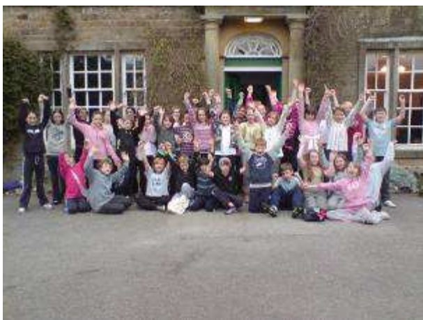
Everyone outside Buckden House

It now seems a long time since the Year 7s returned from Buckden House! The whole year produced some beautiful posters about their experiences. We were delighted to have them on display at Open Day in October. Here is a selection of quotes found amongst their work to go with some of their photographs.